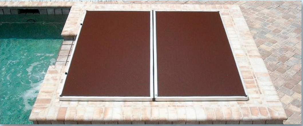
Keep loved ones safe! Spa cover will support weight and won't buckle in the middle.

Made from aluminum, these covers can withstand the harshest elements.