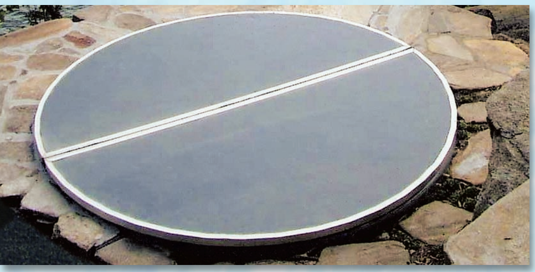
Our aluminum spa covers are completely sealed, inside and out, so they won't absorb water. No more soggy vinyl covers.

Dogs can't chew it. Kids can't fall through it. Sun and snow won't hurt it!